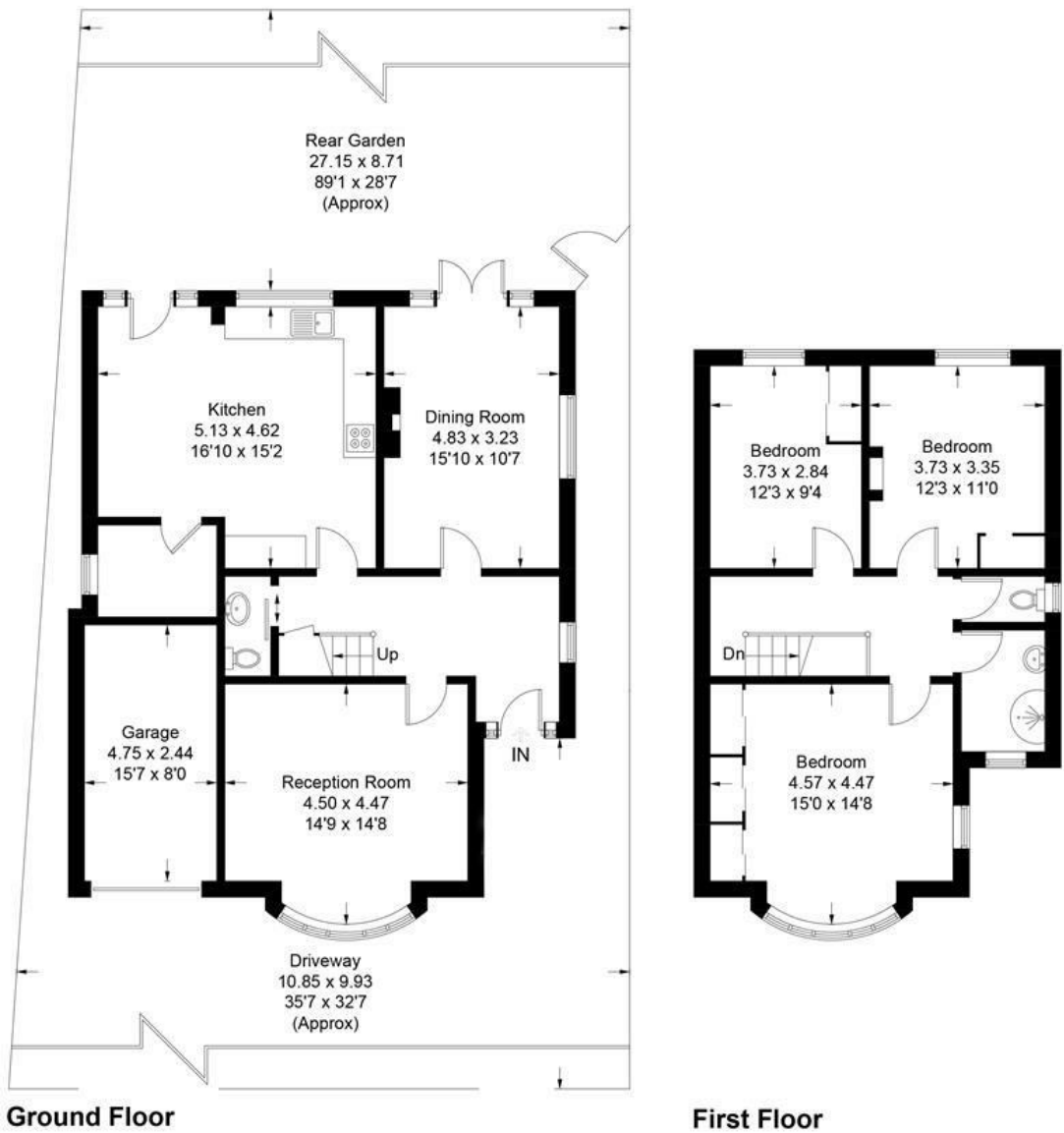
Illustration for identification purposes only, measurements are approximate, not to scale. Fourlabs.co © (ID1266145)