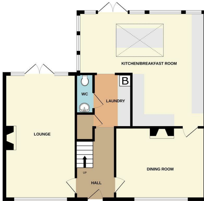
GROUND FLOOR 887 sq.ft. (82.4 sq.m.) approx.