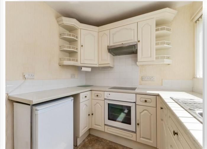
Glendale Road, Middlesbrough TS5 7NL