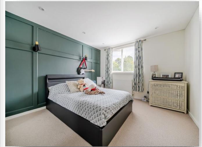
Millson Close, London N20 0LQ