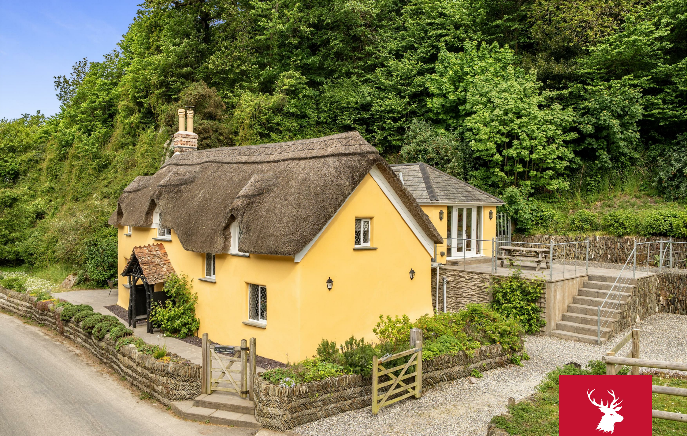
Old Maids Cottage