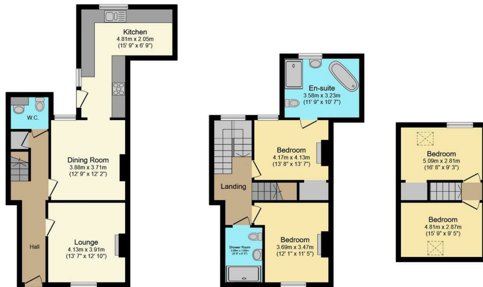
Ground Floor Floor area 51.4 sq.m. (553 sq.ft.)