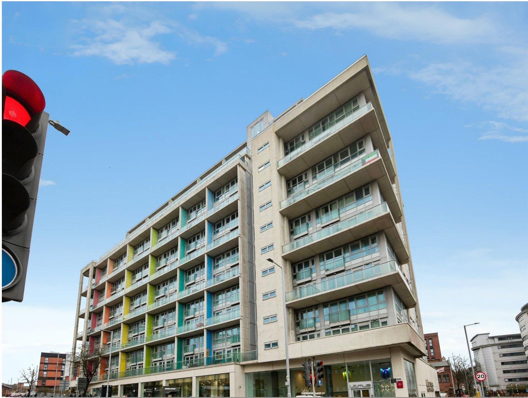
The Litmus Building Huntingdon Street, Nottingham NG1 3NX