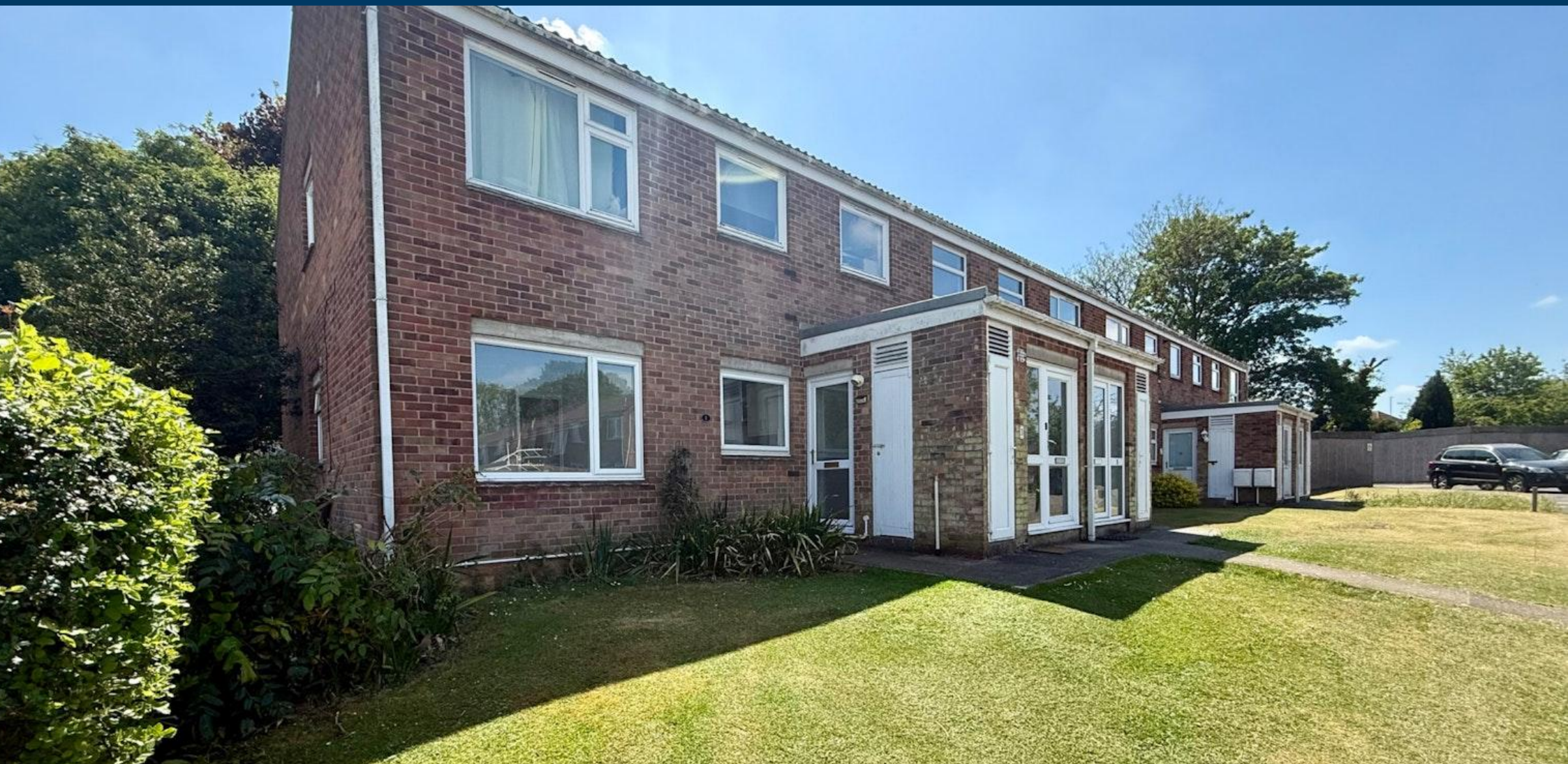
Hawthorn Chase, Uphill, Lincoln