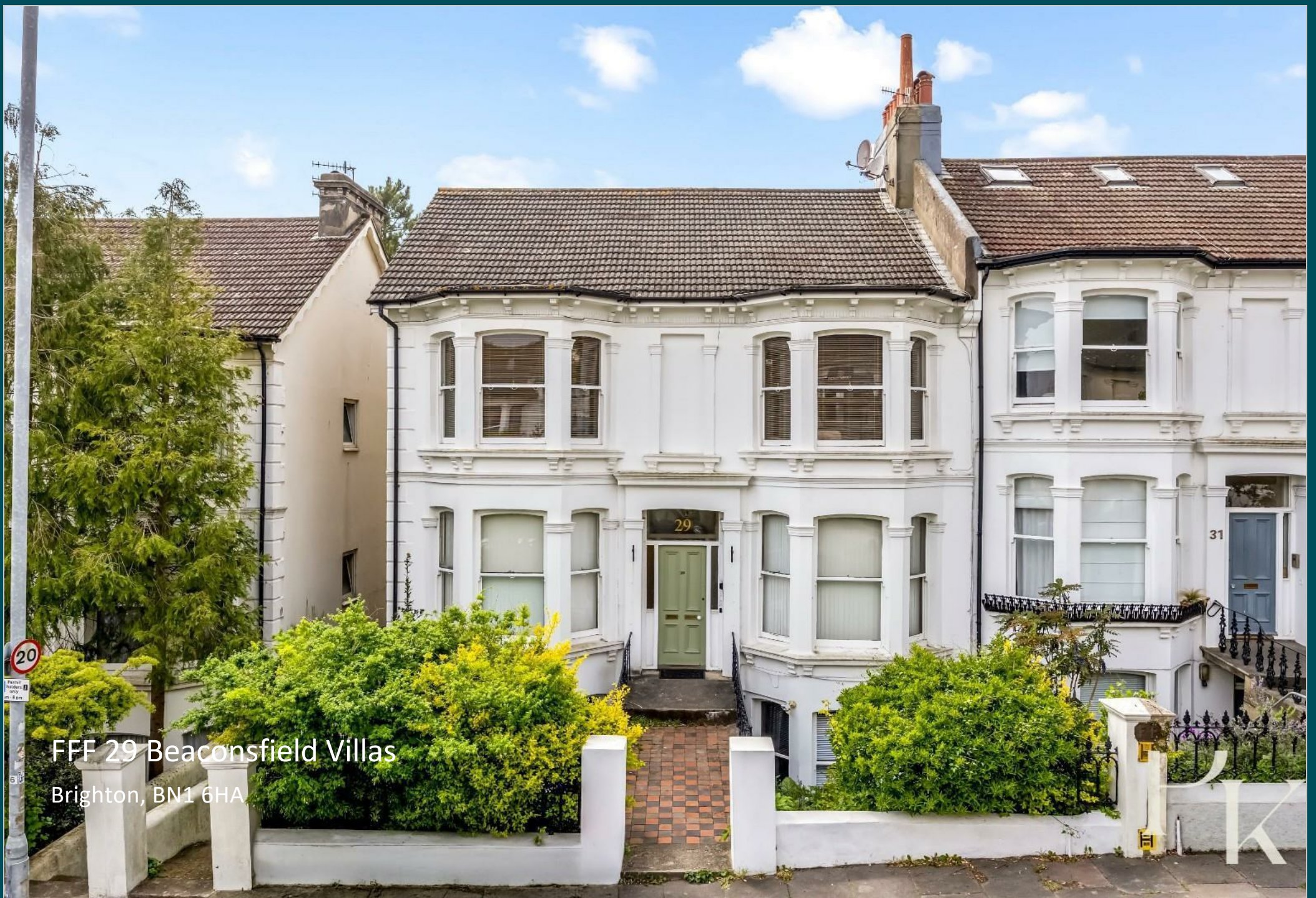
FFF 29 Beaconsfield Villas Brighton, BN1 6HA