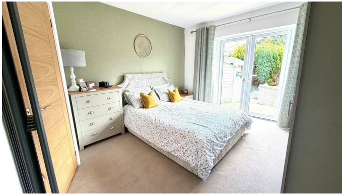
Ladder style radiator, upvc double glazed door leading to rear garden.