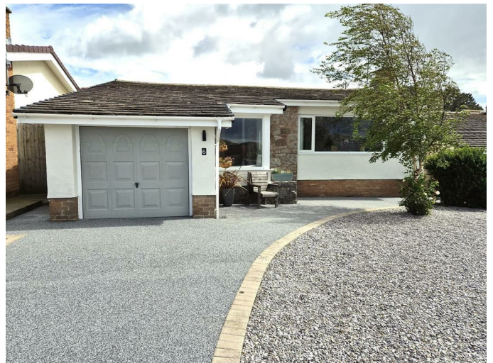
For several cars leads to: