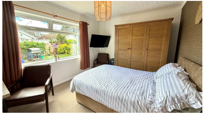
Coved ceiling, radiator with shelf over, upvc double glazed window.