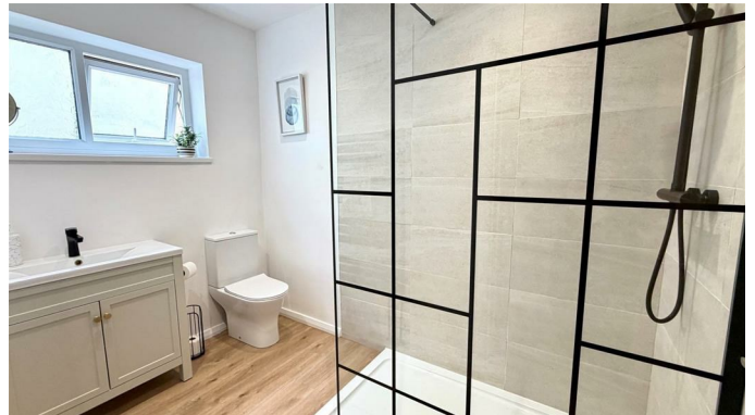
Modern walk-in tiled shower with mains shower with double shower head and glass shower screen, vanity wash hand basin and low flush w.c.