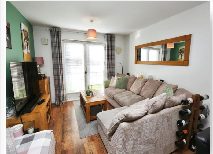
Whiston House, Heritage Way, Gosport PO12 4WE