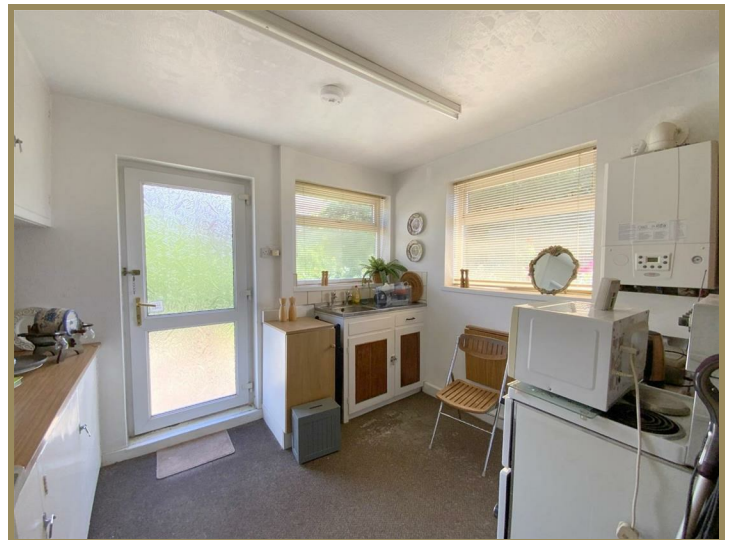
19 Halton Place, Cleethorpes, DN35 9BT £140,000