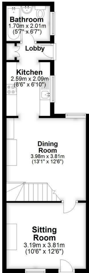
Ground Floor Approx. 38.9 sq. metres (418.7 sq. feet)