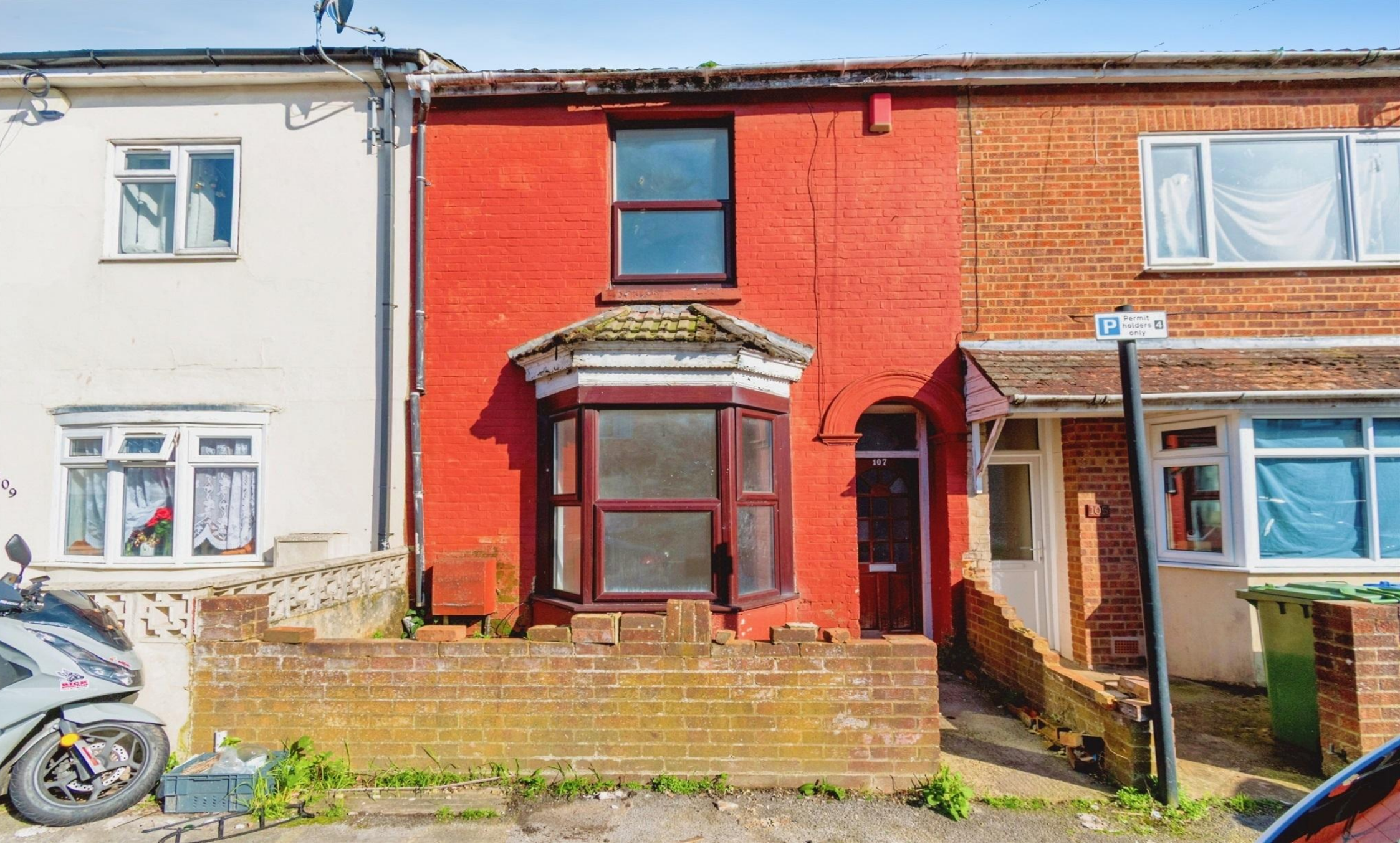
Northumberland Road, Southampton SO14 0ES