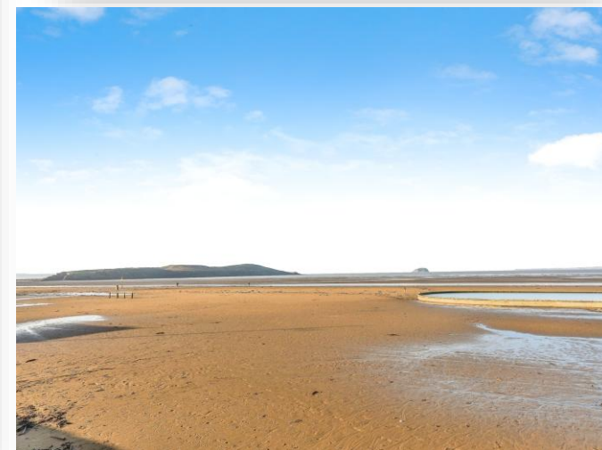
Promenade House, Beach Road, Weston-Super-Mare, BS23 4AP