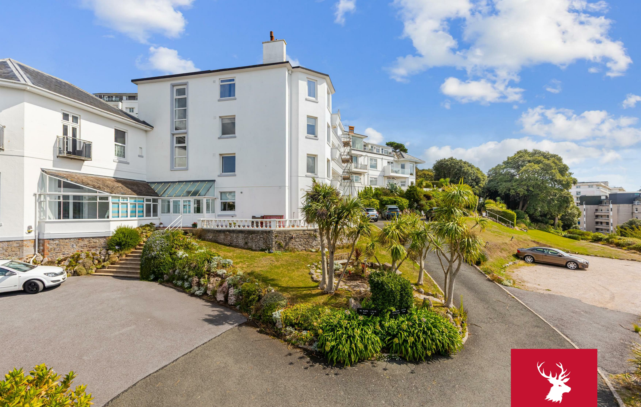
5 Park Hall