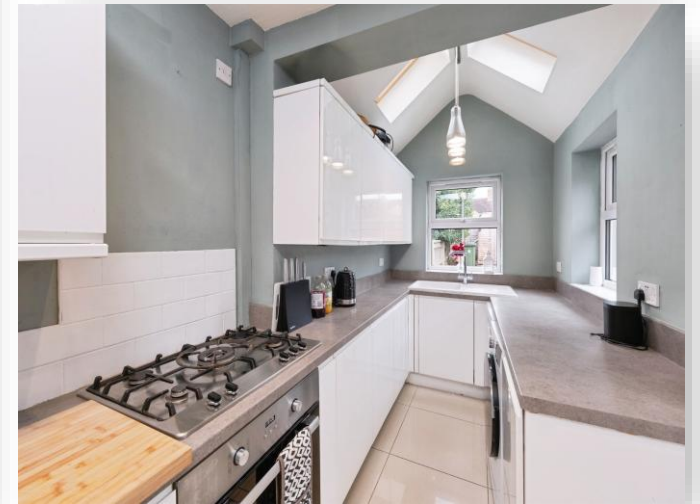
Regent Street, Leighton Buzzard, LU7 3JZ