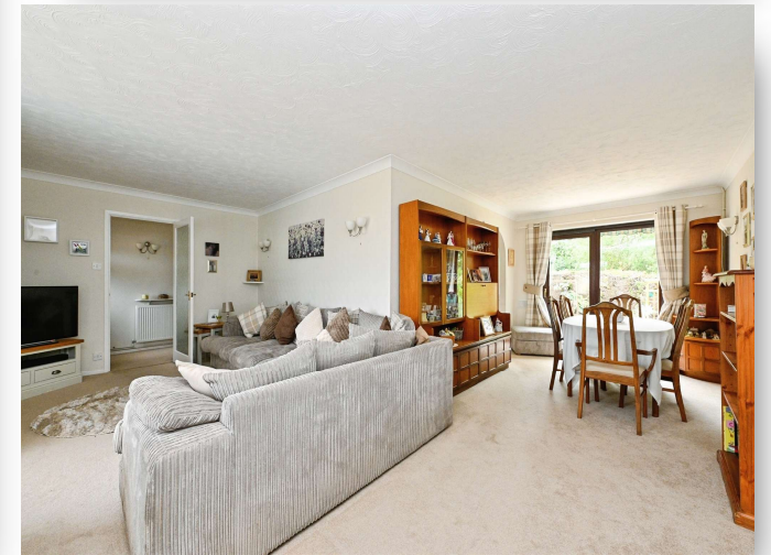
Richmond Road, Downham Market, PE38 9TA