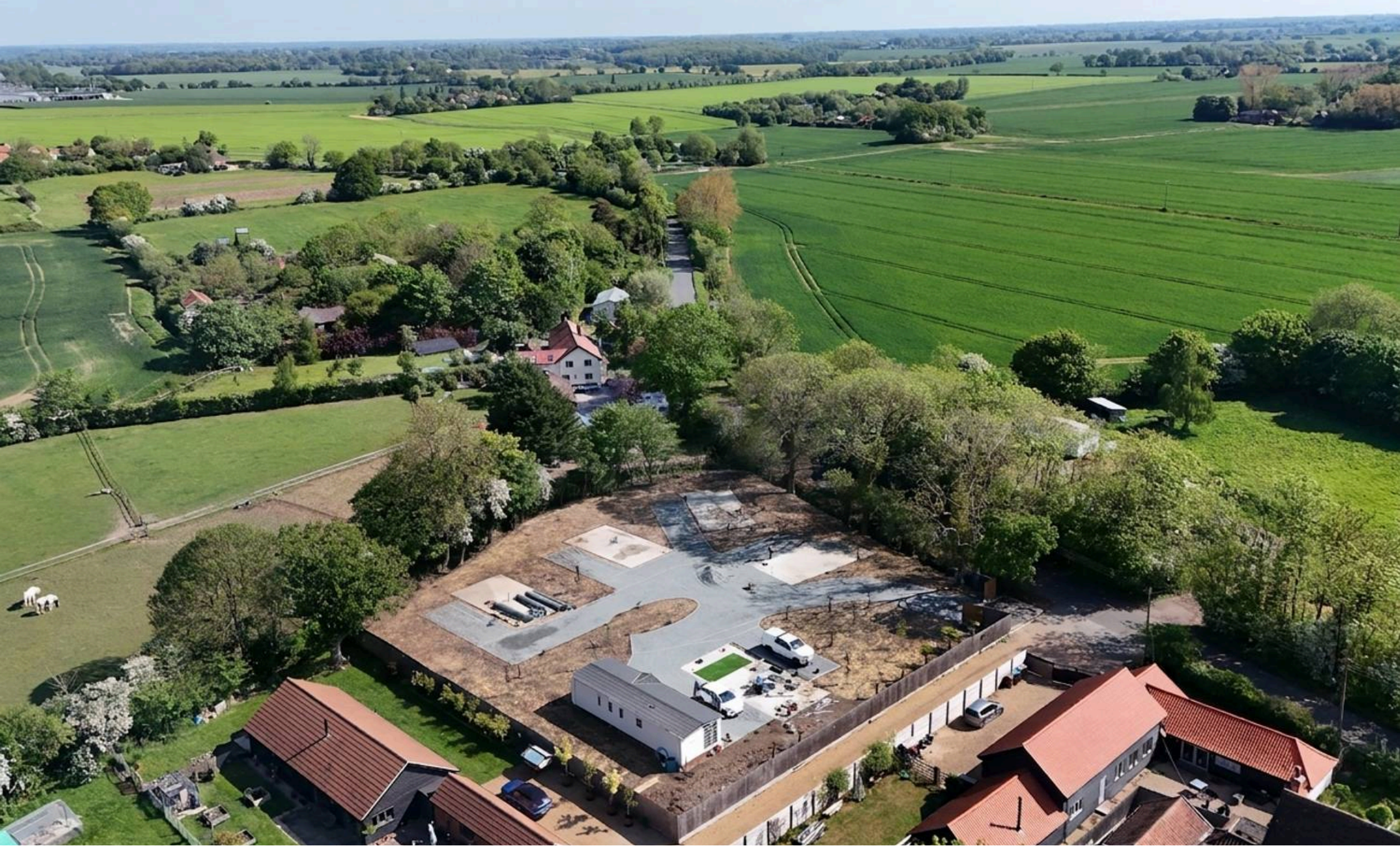
Poplar Farm, Hoxne Road, Denham - IP21 5DN