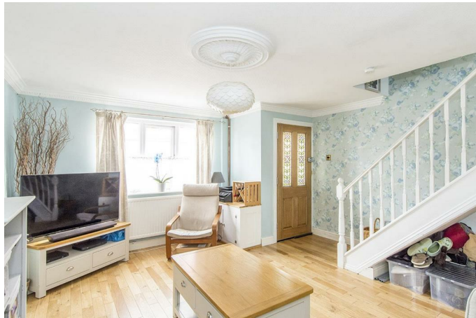
Lounge 16'1" x 13'9" (4.90m x 4.19m)

Accessed via stained glass and leaded timber front door. Double glazed window to the front elevation. Stairs rising to the first floor. Feature ornate ceiling rose and coving. Exposed timber flooring. Television point. Radiator. Door to:-