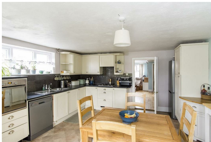
Kitchen Area 14'3" x 11'4" (4.34m x 3.45m)

Fitted base and wall units. Laminated work surfaces with complementary tiled splash backs. Fitted oven and four ring gas hob with extractor fan over. Space and plumbing for automatic dishwasher. Double glazed window to the side elevation. Opening through to:-