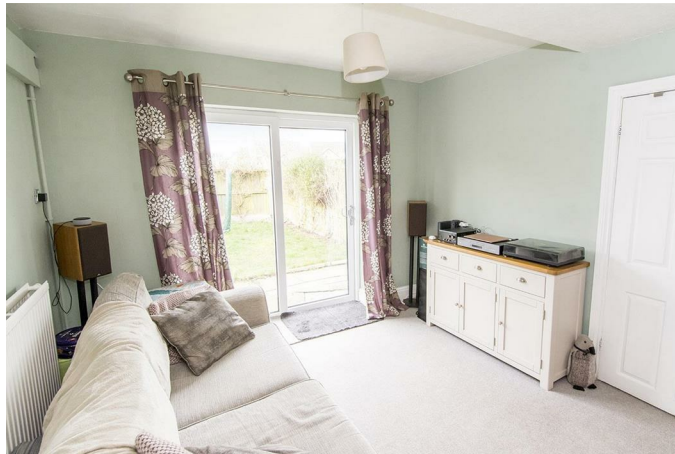
Dining Area 10'8" x 9'11" (3.25m x 3.02m)

Built in cloaks cupboard also housing plumbing for automatic washing machine. Radiator. Sliding double glazed patio doors opening out to the rear garden.