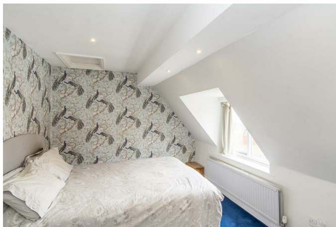
Bedroom One 13'10" x 9'4" (4.22m x 2.84m)

Two double glazed windows to the front aspect. Built in double wardrobe. Radiator.