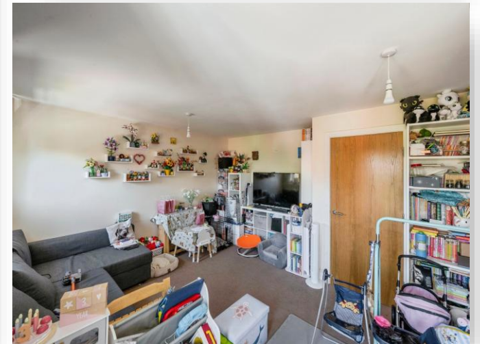
Kilner Court, Denaby Main Doncaster DN12 4DH