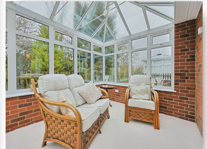
Lilac Mews, Swanton Morley, Dereham, NR20 4FL