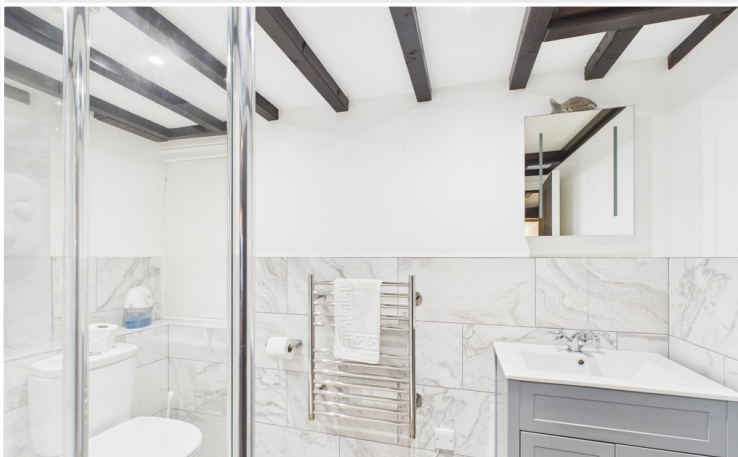
En Suite Shower Room