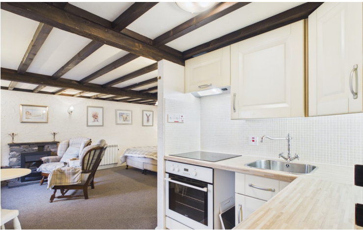
Kitchen and Living Space

Location You can step from the door and within minutes be at the lapping shore of beautiful Coniston Water, whilst an admittedly more strenuous hike can take you into the very heart of the dramatic Coniston mountain range to the west - all without having to move the car from its berth in the car parking space provided. Nearby Coniston village and Torver provide for all of your daily needs, refreshment and entertainment if having the beautiful National Park on your doorstep alone is not enough.