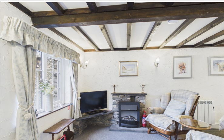
Living Room Area

Request a Viewing Online or Call 015394 32800