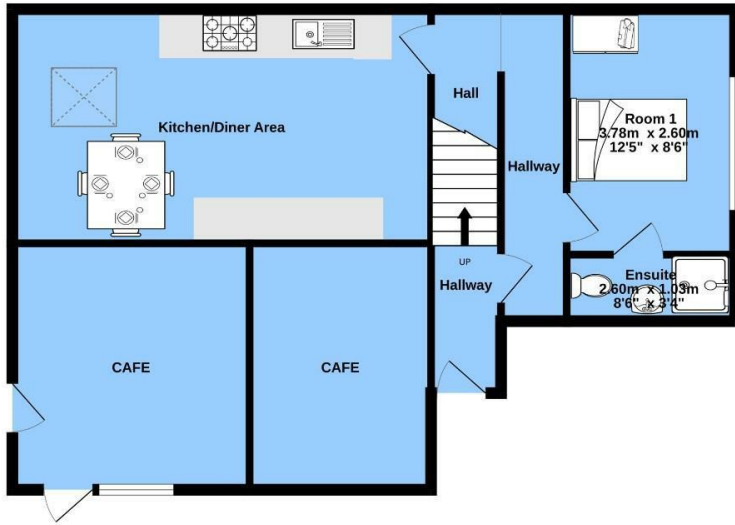
GROUND FLOOR 71.6 sq.m. (771 sq.ft.) approx.