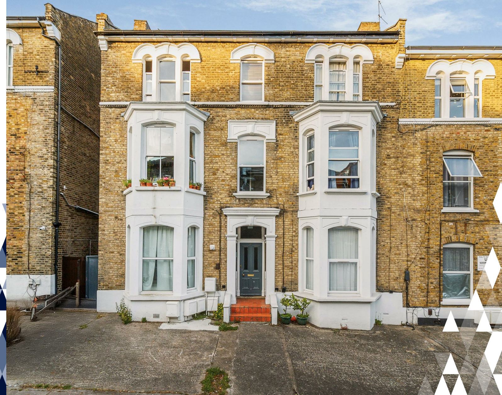
Alfred Road Approximate Gross Internal Area = 29.5 sq m / 315 sq ft