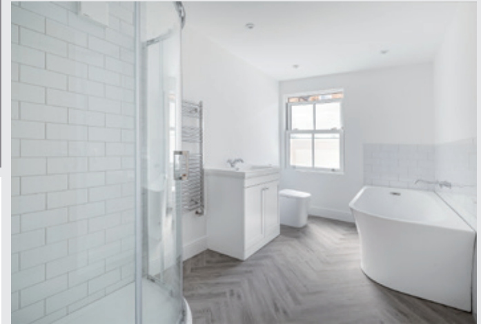
Illustration for identification purposes only. Measurements are approximate. Not to scale. Produced by rickcauzaphoto.pro for Alexandre Boyes