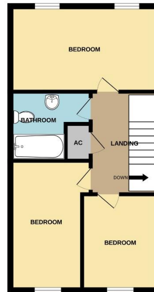
2ND FLOOR 419 sq.ft. (38.9 sq.m.) approx.