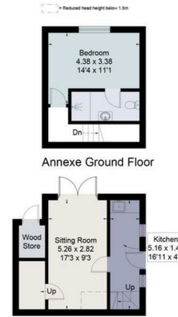
Annexe Ground Floor

(Not Shown In Actual Location / Orientation)