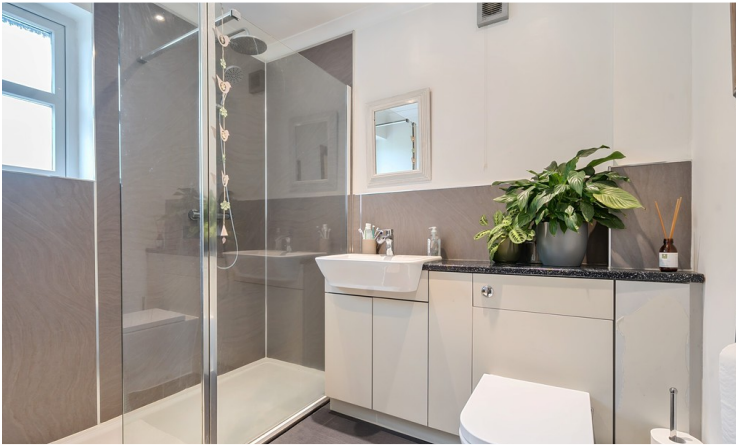
House Shower Room