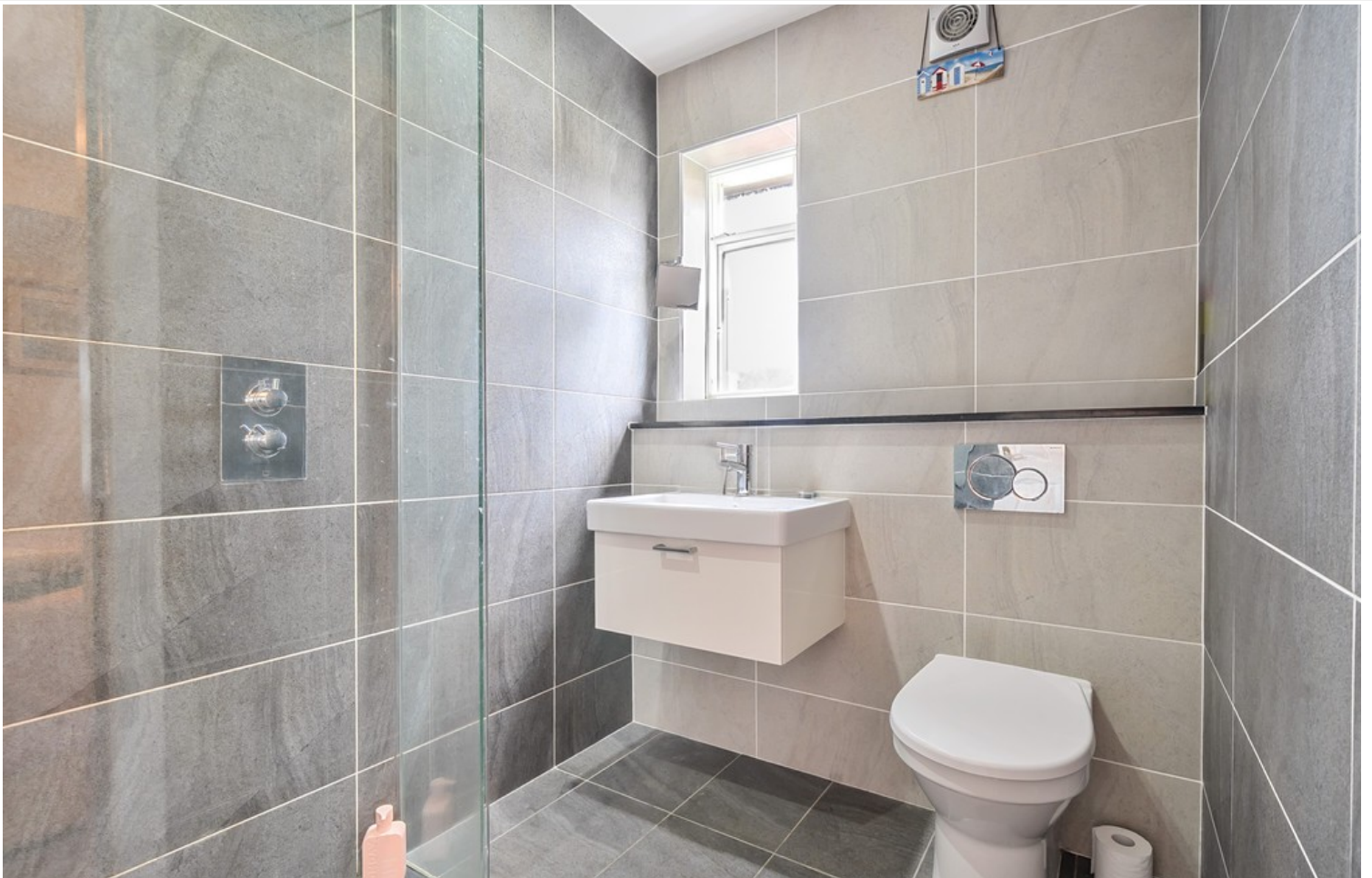
En Suite to bedroom One