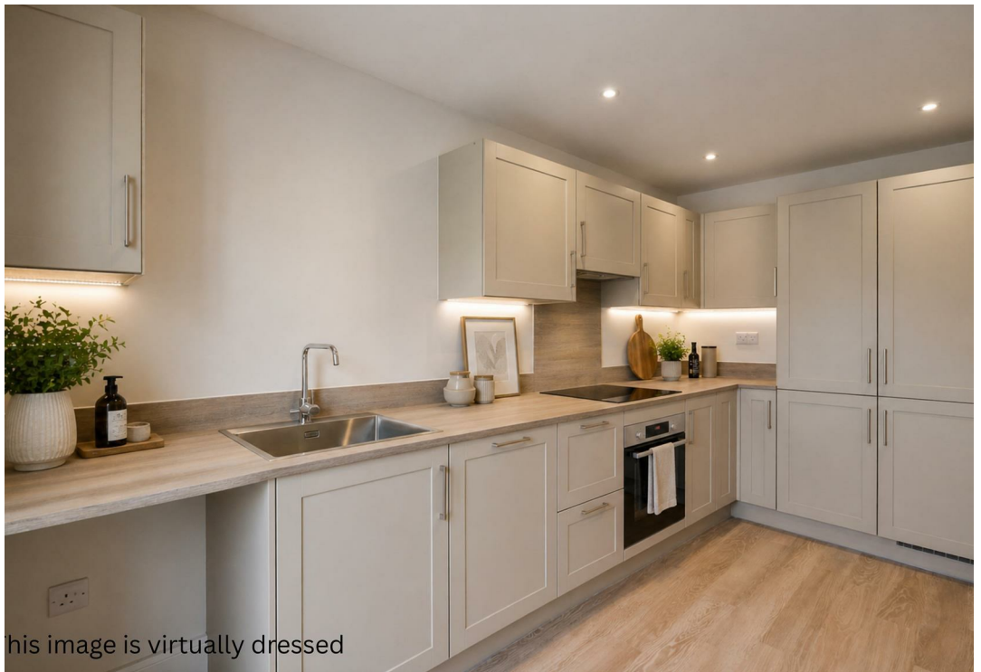
this image is virtually dressed