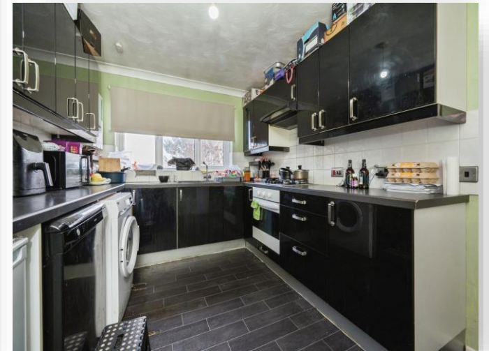
Grove Gardens, Southampton SO19 9QZ