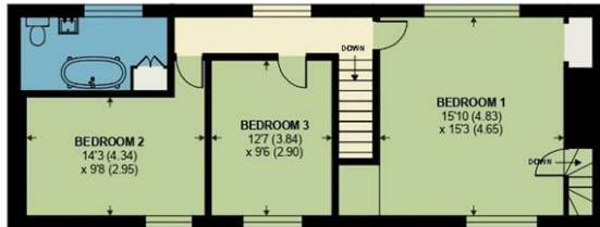
GLEBE FARM FIRST FLOOR