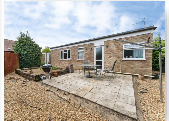
Townend Pitts Lane, MARCH PE15 9QP