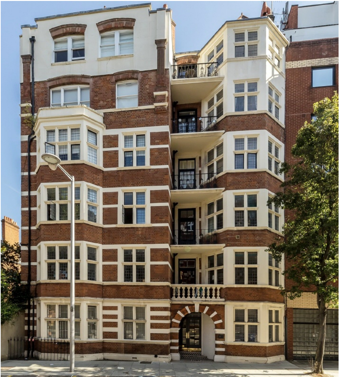
Drayton Gardens, SW10 £1,000,000