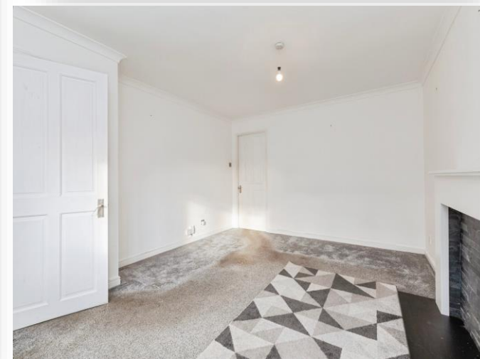
Ark Royal Close, Hartlepool, TS25 1DH