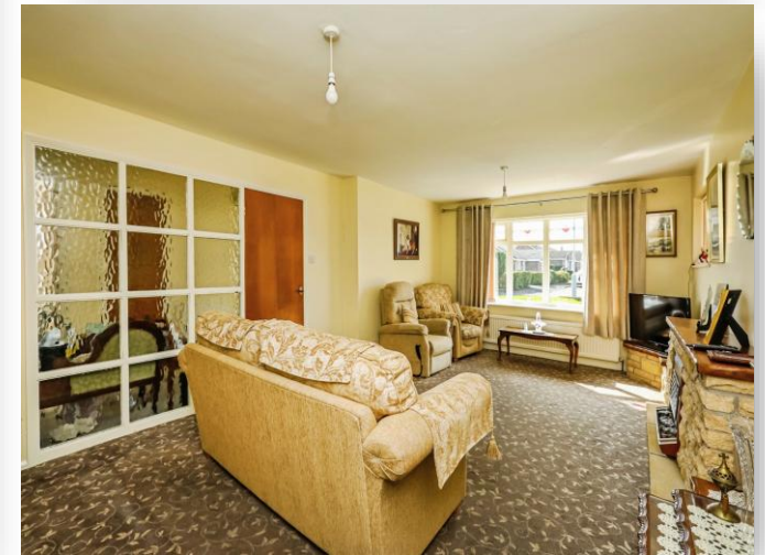
Longfield Drive, Ravenfield Rotherham S65 4LF