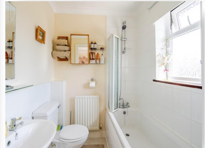
Olivers Meadow, Westergate Chichester PO20 3YA