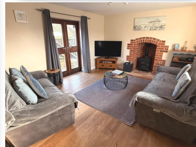
Stepping Stone Cottage, Walcott Road, Bacton NR12 0LR