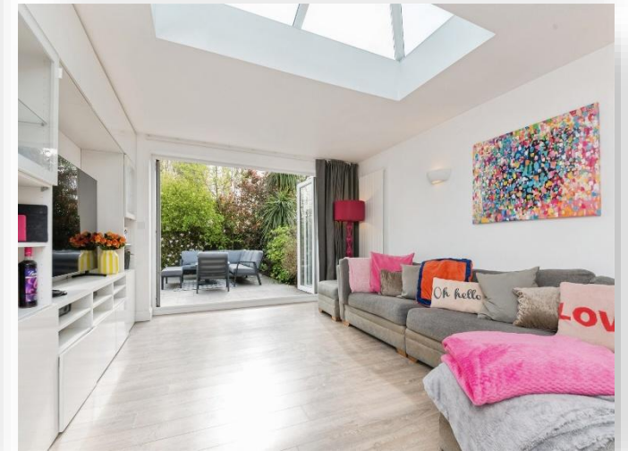
Campernell Close, Brightlingsea, Colchester, CO7 0TA