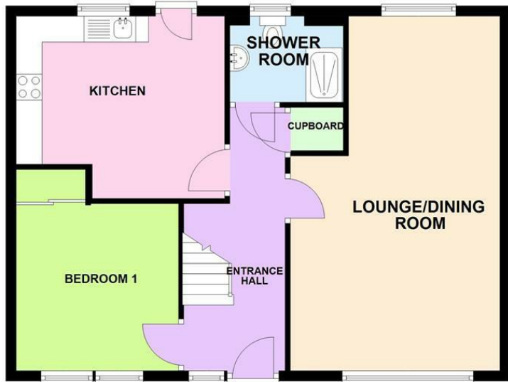
17 BRATHWIC PLACE