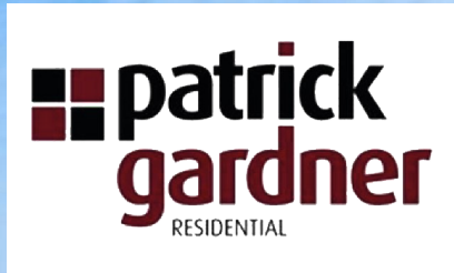
The Byre Cottage, Stoney Croft Farm, Chalkpit Lane, Betchworth, Brockham, RH3 7EZ