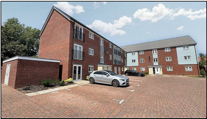
Apt 1, 8 Aldridge Square, Great Barr, B42 2GQ