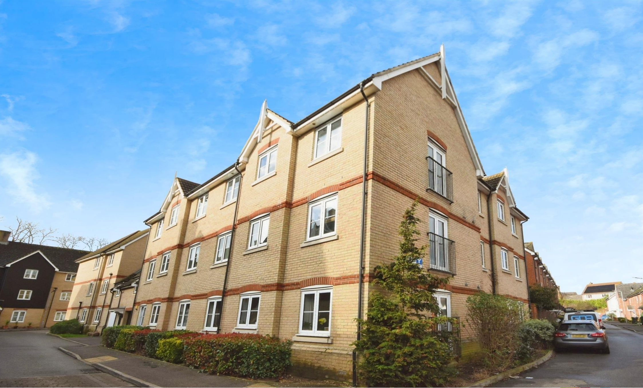
Harberd Tye, Great Baddow Chelmsford CM2 9GJ