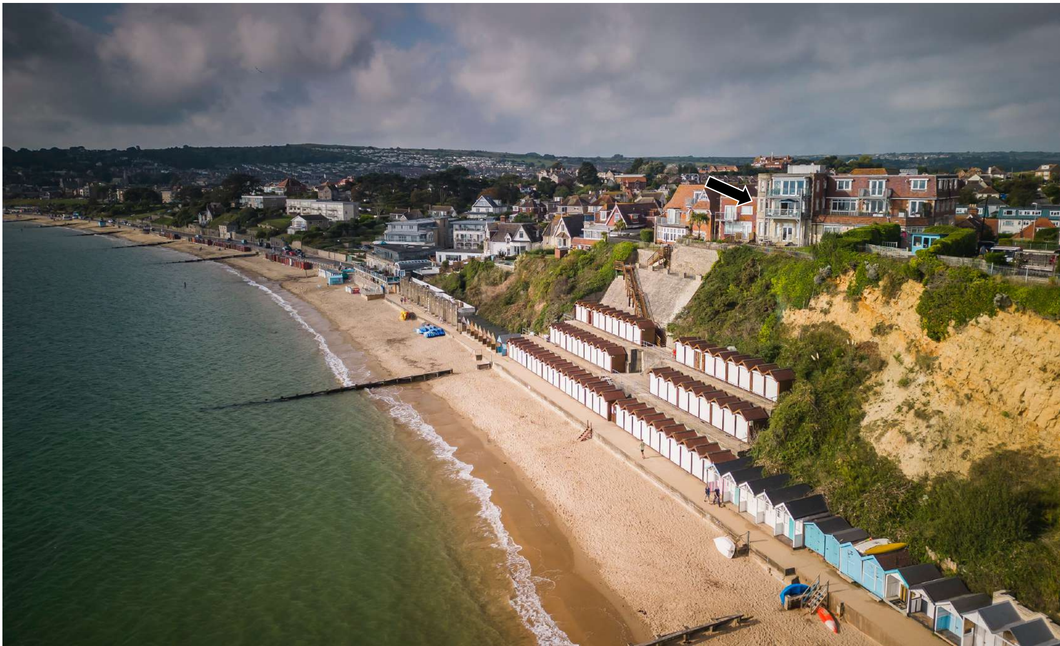
APARTMENT 6 HIGHCLIFFE, 4 HIGHCLIFFE ROAD, SWANAGE £695,000 Leasehold