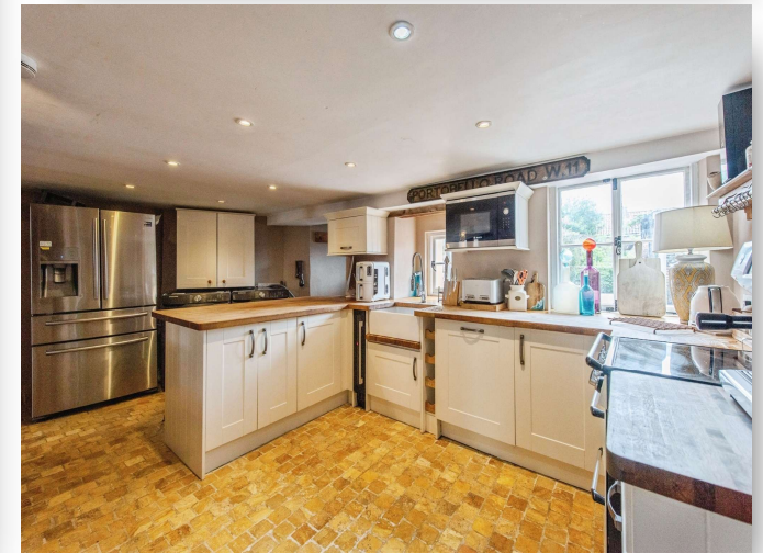
Bury Street, Stowmarket, IP14 1HH