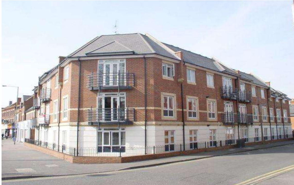
Henley Court, Egham, Surrey, TW20 9DZ