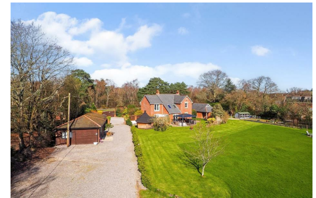
The Haven, Romsey Road | £1,250,000 Copythorne, Southampton, Hampshire, SO40 2PF