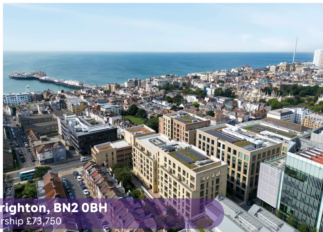
Edward Street, Brighton, BN2 0BH Shared Ownership £73,750