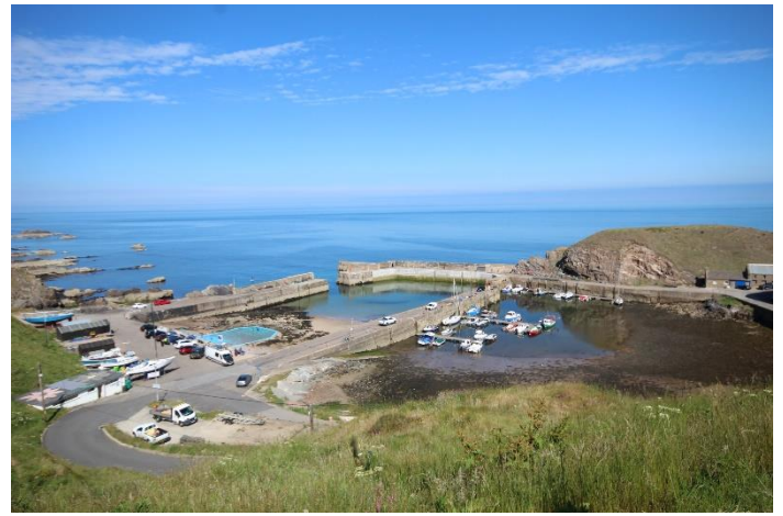
The picturesque harbour and rugged coastline are close to the property