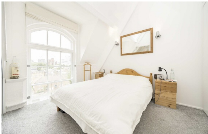
Westminster Bridge Road, SE1